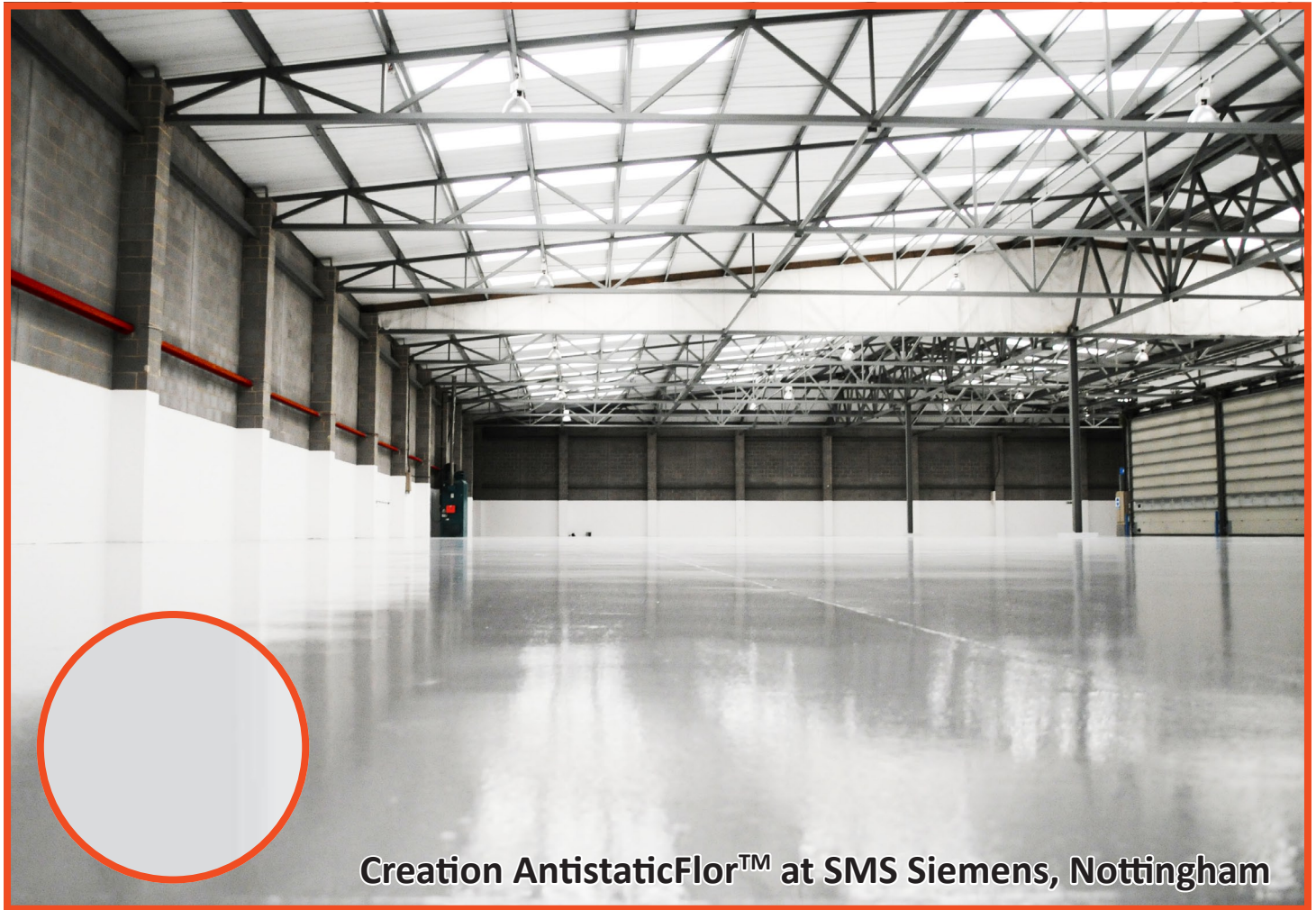
Creation AntistaticFlor™ at SMS Siemens, Nottingham

For areas where static charge can not be tolerated we are able to install a Creation AntistaticFlor™.