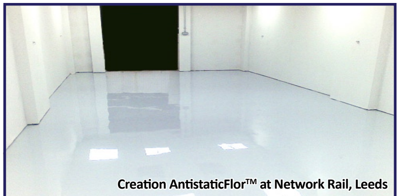
Creation AntistaticFlor™ at Network Rail, Leeds

A wide variety of finishes including high chemical and slip resistance are available. A Creation AntistaticFlor™ can be installed in any environment.